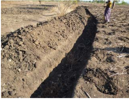
Figure 11.11 Infiltration pit, Neno District.