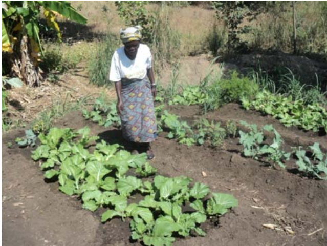
Figure 11.17 A woman managing her vegetable garden, Balaka District.

communities, no incentives or subsidies will be required for them to take remedial measures.