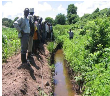
Figure 11.14 Infiltration pits, Karonga District.