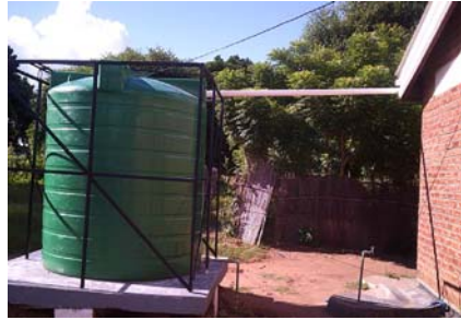
Figure 11.3 Plastic tanks for rainwater harvesting, Balaka District.

plastic tanks (Figures 11.3–11.5). To date over 500 above ground tanks have been constructed for roof-top water harvesting across the country.