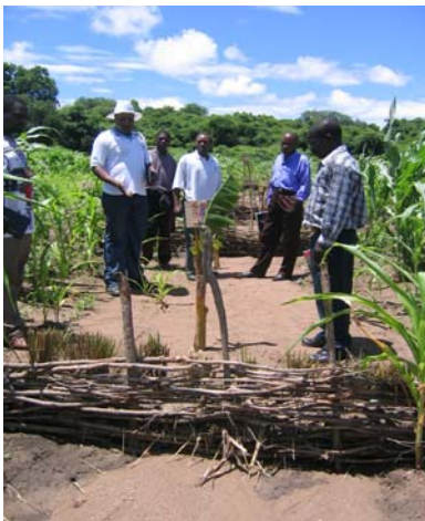
Figure 11.13 Check-dams, Karonga District.

In Liwonde Village, Neno District, rainwater stored in the ponds and hand dug wells is used productively in watering vegetables and fruit trees. Farmers are growing different vegetables (Chinese lettuce, mustard and tomatoes) in their fields that are recharged using in-situ techniques. The vegetables are growing well and are able to be used as a source income for the households. The success of in-situ techniques is attributed to the fact that they are cheap and easy to implement. Due to the huge potential of scaling up these in-situ techniques, more efforts have been devoted to capacity building of communities to enable effective implementation. The structures are continually monitored so that some minor maintenance is done by individual land owners. Implementation of in-situ techniques is achieved in clusters formed by the farmers. Choice of sites for