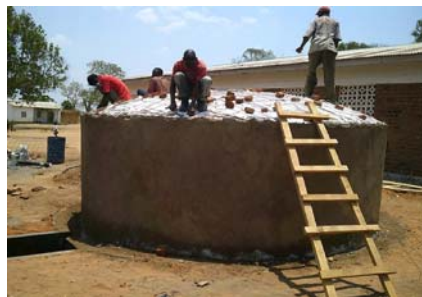
Figure 11.5 Ferro-cement tank under construction.