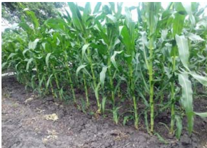
Figure 11.15 Maize under residual moisture..

These FBFS serve crop production, fishery, livestock, and are the sustenance of local ecological systems. Dependent on flood events, they are prone to climate change, yet they have considerable unused economic potential, as can be seen