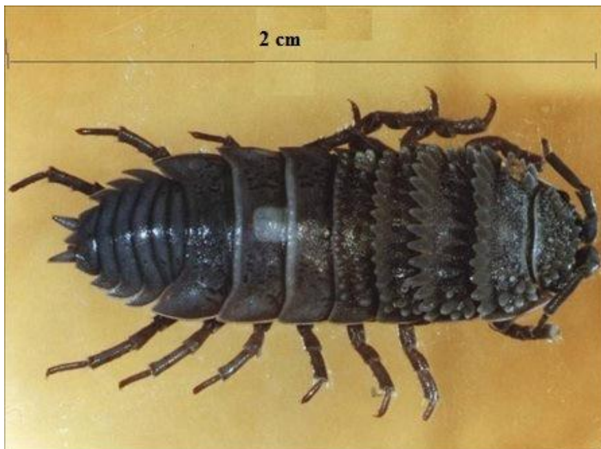
Figure 1 A dorsal view of a female Hemilepistus shirazi Schuttz (Rahbar et al. , 2015)

This viviparous organism lives for about one year. The white brood pouch under the abdomen of the female swells in March. The eggs form larvae in the pouch, and 60-70 sowbugs, very similar to their parents, are released from the pouch in May. They are very active in the spring and fall. They come out of their burrows in the cool air of early morning and late afternoon. It seems that digging deep into the soil is to reach a humid surrounding. There are semi-spherical spaces at the end of their burrows, five to 10 cm in diameter (Rahbar et al. , 2015). They form semi-cylindrical, rods of soil, two mm long and one mm in diameter (burrowed materials), with their mandibles, and place them to one side of the opening of their burrows (Figure 2). These rods are seemingly more resistant to slaking than the freshly laid sediment from which they are formed. As some remains of the sowbug are found in scorpion burrows, it is believed that Hemilepistus shirazi Schuttz is eaten by this arachnid.