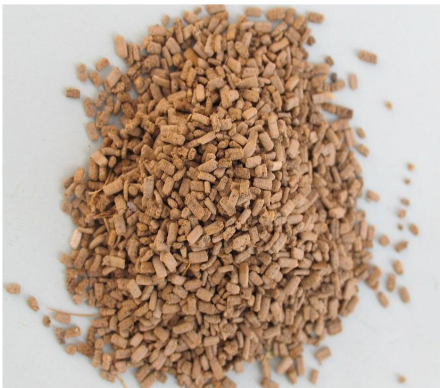
Figure 2 Parallelepiped-shaped burrowed materials of sowbug