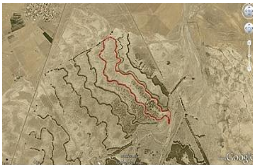
Figure 4 Location of the 2 nd sedimentation basin of Bisheh Zard 1

Where AS is aggregate stability, Wis the weight of oven dried- aggregates and S is the weight of sand particle.