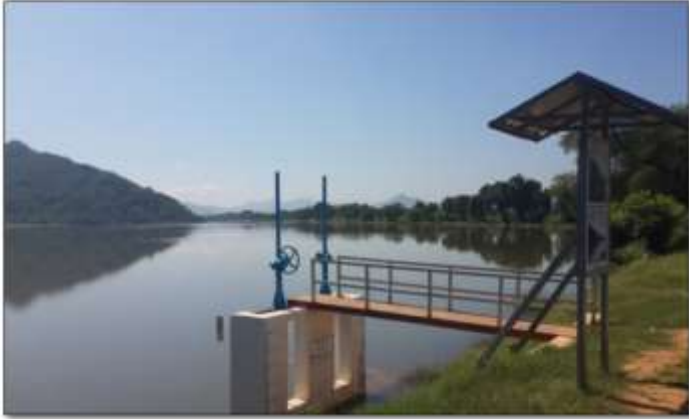
Gravity flow Irrigation