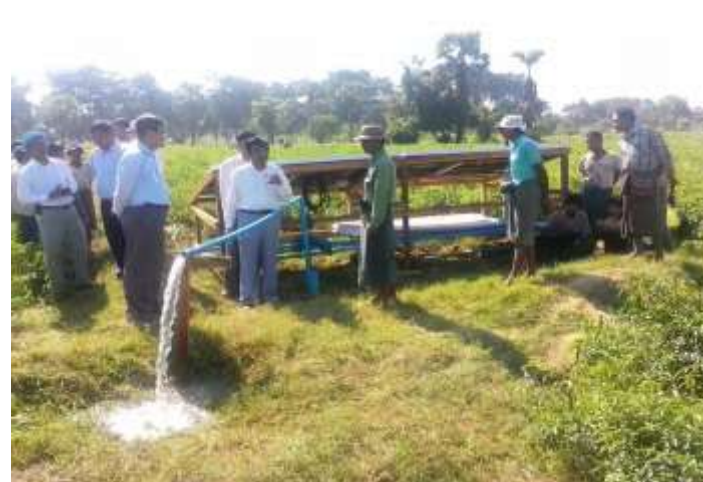
GW Tube well Irrigation